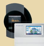
Solar-Log™ and Meteocontrol WEB'log Accessories