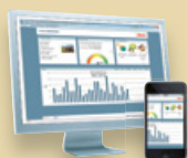
StecaGrid Portal Web portal